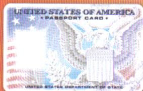
U.S. Passport Card