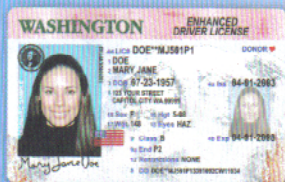
Enhanced Driver's License